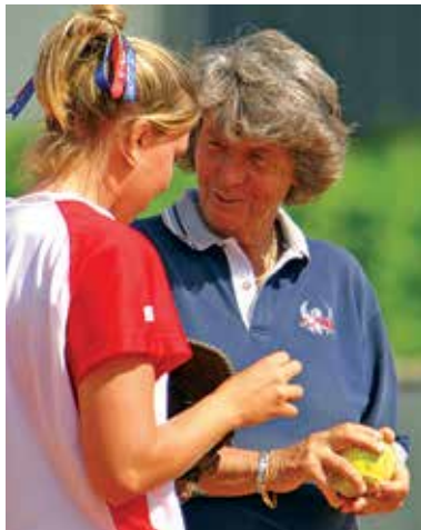
Women's softball coach at Florida Atlantic University.

Many consider her as “The Greatest Woman Athlete of All Time.” Her jaw-dropping achievements/honors take pages to list, including 20 Hall of Fame inductions, Connecticut Athlete of the Year (selected by the Connecticut Sports Writers Alliance), and a softball field renamed Joan Joyce Field (a part of Municipal Stadium in Waterbury).